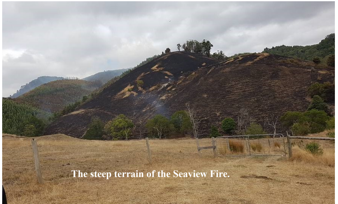
The steep terrain of the Seaview Fire.

On a happier note, you may be aware that the brigade had some equipment stolen from the fire ground recently. We have been overwhelmed by the many offers of support and have received generous donations that will allow us to replace the equipment. Thank you all for your contributions. Stay alert and stay safe.